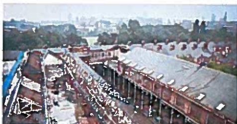
Fiveway's House has been sold, awaiting a re-start of the conversion