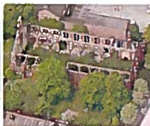
Some interest by developers, discussions ongoing to attempt to save the remains of the buildings.